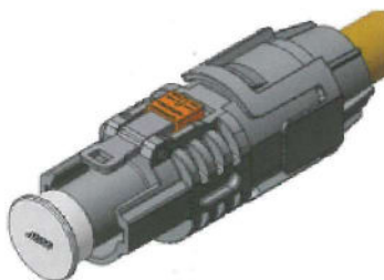
Negative Pole: HV1P-0BK-35